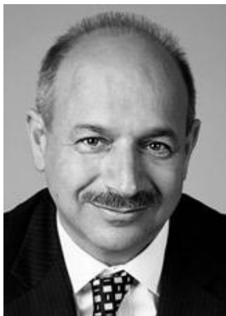
Bruce A. Beutler