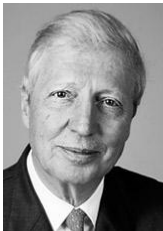
Jules A. Hoffmann