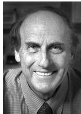
Ralph M. Steinman

The Nobel Prize in Physiology or Medicine 2011 was divided, one half jointly to Bruce A. Beutler and Jules A. Hoffmann "for their discoveries concerning the activation of innate immunity" and the other half to Ralph M. Steinman "for his discovery of the dendritic cell and its role in adaptive immunity"