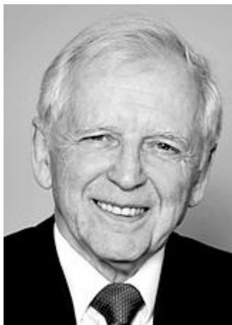
Harald zur Hausen