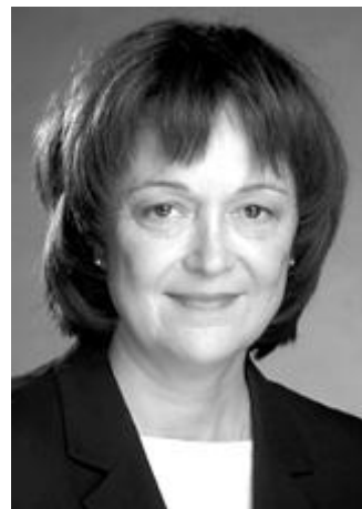
Linda B. Buck

The Nobel Prize in Physiology or Medicine 2004 was awarded jointly to Richard Axel and Linda B. Buck "for their discoveries of odorant receptors and the organization of the olfactory system"