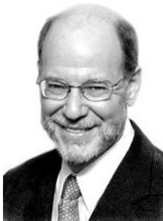
H. Robert Horvitz