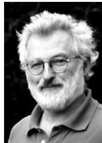
John E. Sulston

The Nobel Prize in Physiology or Medicine 2002 was awarded jointly to Sydney Brenner, H. Robert Horvitz and John E. Sulston "for their discoveries concerning genetic regulation of organ development and programmed cell death"