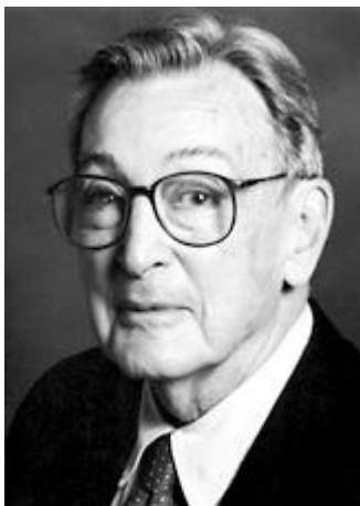
Robert F. Furchgott