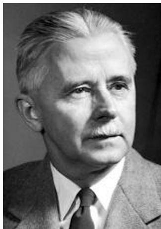
Haldan Keffer Hartline