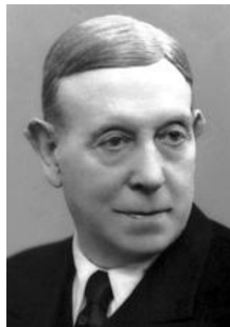
Antonio Caetano de Abreu Freire Egas Moniz

The Nobel Prize in Physiology or Medicine 1949 was divided equally between Walter Rudolf Hess "for his discovery of the functional organization of the interbrain as a coordinator of the activities of the internal organs" and Antonio Caetano de Abreu Freire Egas Moniz "for his discovery of the therapeutic value of leucotomy in certain psychoses"